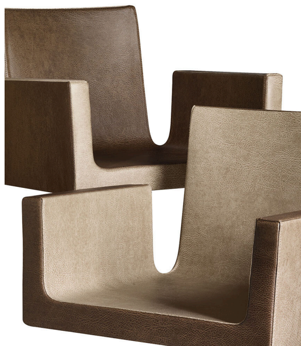
IN PHOTO COLOURS A: VINTAGE ASH G4 - B: VINTAGE BROWN F5

Le immagini sono fornite al solo scopo illustrativo e non costituiscono elemento contrattuale