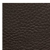
hot chocolate 60