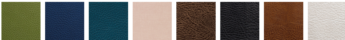
olive G8 royal blue G9 marine L2 strawberry milk K4 vintage brown F5 vintage black G1 vintage tan G2 vintage white G3