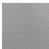
light grey G5