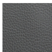
dark grey G6