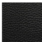
black coffee 59

All Luca Rossini products are available in a wide choice of colours at no extra cost!